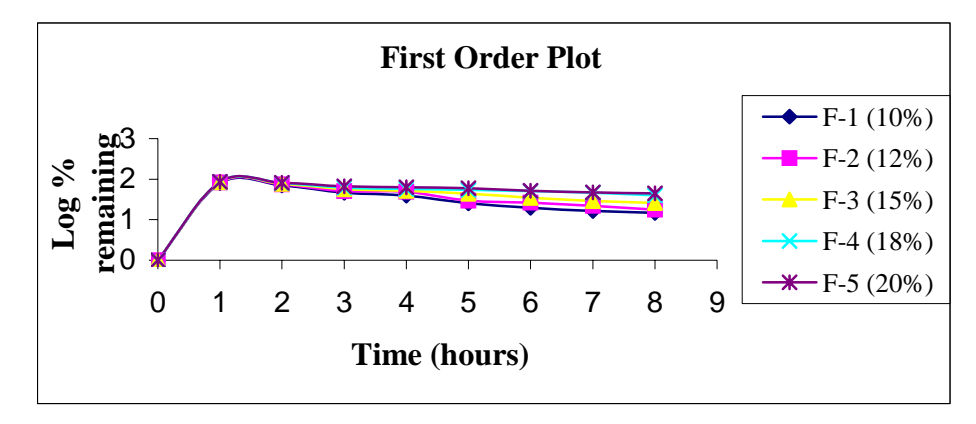
Figure 1. Effect of kollidon SR on theophylline from proposed formulations in gastrointestinal fluid and intestinal fluid (First order plot).

the mechanism of release kinetics was determined. When correlation coefficient is close to 1.0, the release kinetics will be following that order of the proposed formulations. From table 3, it was observed that proposed formulations F-3 and F-4 followed Higuchi release mechanism.<sup>12</sup> Although formulations F-1, F-2, F-3, F-4 and F-5 followed first order and Higuchi release kinetics, the release kinetics was very close to 1 (one) in case of Higuchi plot than other kinetic orders that indicated Higuchi release kinetics was predominant here.