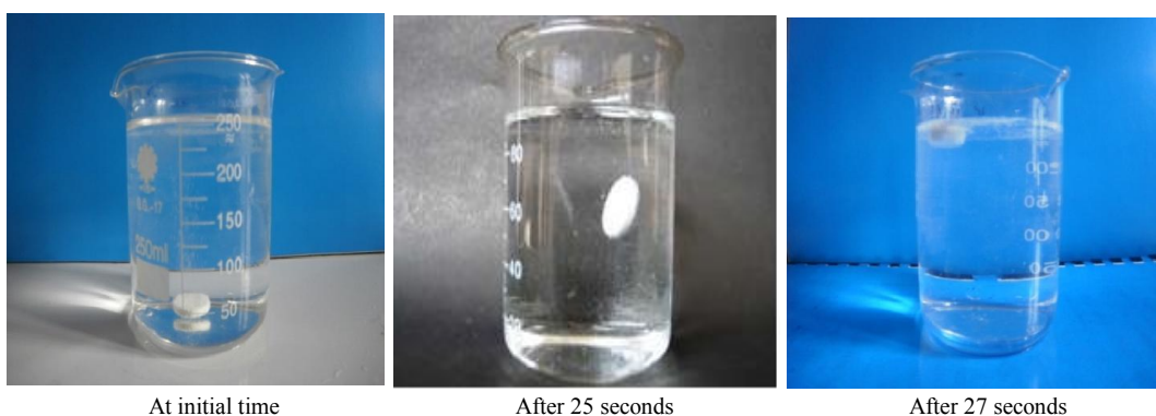
Figure 1. In vitro floating behavior of atorvastatin floating tablet.