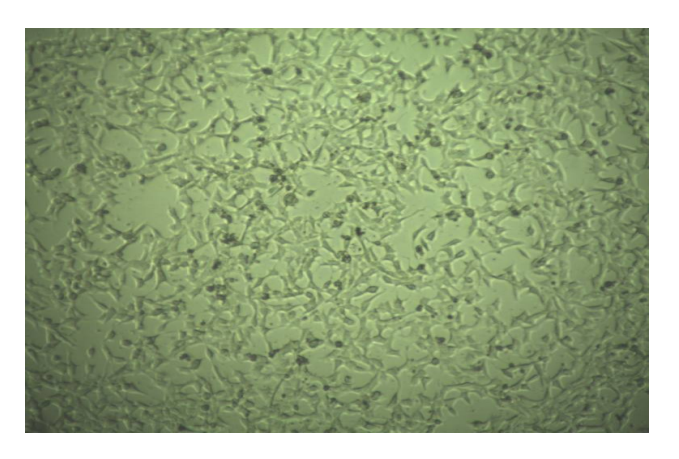
Figure 1. Cytotoxic activity of ethyl acetate soluble fraction of A. capillus-veneris L. under an inverted light microscope.