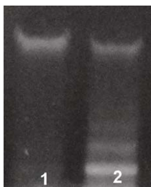
Figure 2. Fragmentation of genomic DNA of V. cholerae serogroup Ogawa treated with S. cumini extracts (600 µg/ml) in vivo . Here, Lane 1 and 2 represent for genomic DNA from V. Ogawa incubated without plant extract and with plant extract respectively for 3 hours.